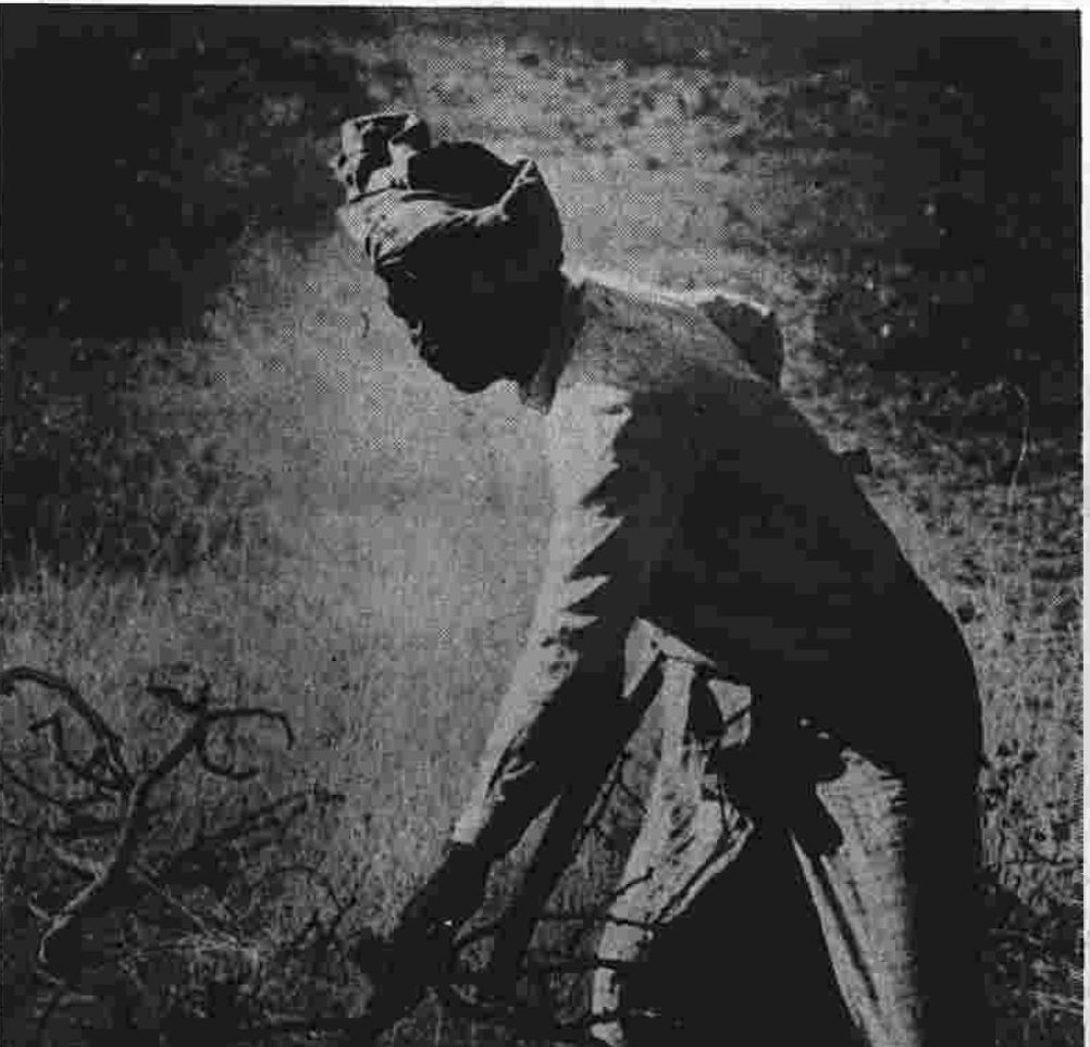
Pagan peasant collecting wood is probably clothed much as his ancestors were a thousand years ago.