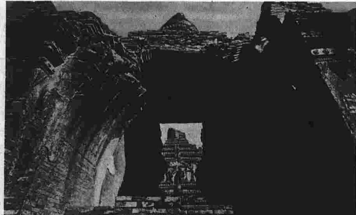
Noble brick vault gave entrance to inner sanctuary through massive wall.