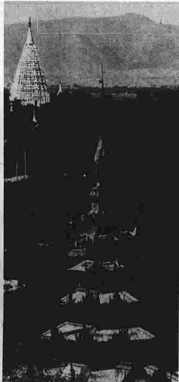
19th century pagoda (front) and 12th century relic (rear).