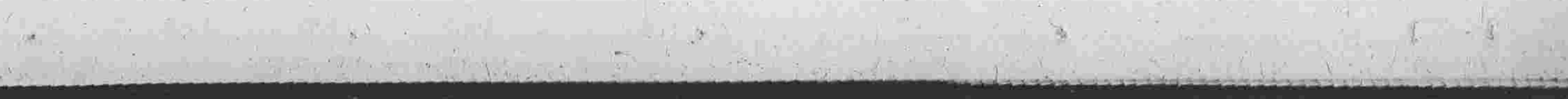
Parked motorbikes, many of Japanese manufacture, crowd the plaza outside the National Assembly Building in Saigon. The influx of U.S. money has put Vietnamese on a buying spree.