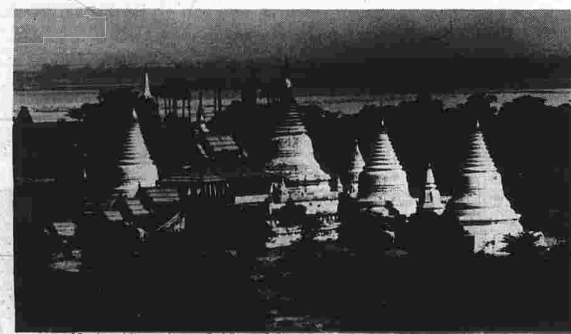
Monks whitewash some of Pagan's temples to earn merit for future lives; the temples were built as offerings to religion.

Secluded in the interior of Burma, a hermit among southeast Asian nations, lies an antique landscape of haunting beauty and majesty. The ruins of Pagan are one of the greatest and best preserved historical monuments in Asia, relics of the capital of an ancient kingdom which flourished for two and a half centuries between roughly 1044 and 1287. The monuments stand witness to the ardent Buddhist convictions of Pagan's rulers. They were religious offerings, built as handsomely as the donor, usually a king or prince, could afford. Except for a few monasteries and libraries, the buildings had no practical value; they were not churches in our sense, though they did serve to remind the people of Buddha and his teachings. At one time, Pagan had about 13,000 religious buildings in brick or stone. Over 1,000 remain basically intact, and some 6,000 more survive in a ruined state, scattered over about 240 square miles. The ruins of the old city of Pagan lie in a broad arc twelve miles long on the left bank of the Irrawaddy river. The people of Pagan today, hardworking peasants, live in a handful of quiet villages separated by arid land and dominated by towering monuments of all shapes and sizes. Their lives seem to have changed little since Pagan was overrun in 1287 by Mongol invaders led by Kubla Khan, and Burma's golden age came to an end.